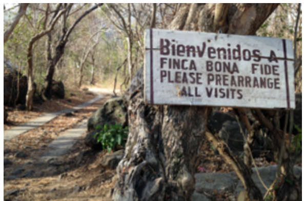
The farm entrance from below as viewed from the main road

FROM BALGUE TO THE FARM ENTRANCE (10 minutes): Buses either stop at the “Puente Balgüe” (Balgüe River Bridge) or continue on past the Finca Bona Fide entrance. Whether riding or walking, continue east on the main road about 350 meters past the “Puente Balgüe” sign over the small Balgüe River (more like a stream). This will include passing the point where the road changes from paved to gravel. Look for the Finca Bona Fide sign and road on the right. Enter through the opening next to the locked gate. The road has concrete tracks and leads uphill.